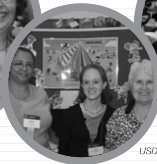
USDA, Food and Nutrition Services